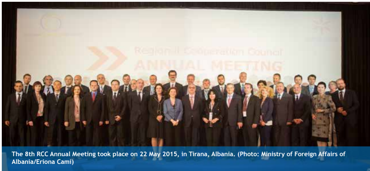
The 8th RCC Annual Meeting took place on 22 May 2015, in Tirana, Albania.

sent a signal to the RCC and its participants from the region regarding the importance of the shared vision, joint development targets, measures and instruments that constitute the SEE 2020 Strategy. The pace of implementation of the SEE 2020 Strategy has primarily been determined by the strength of political commitments, the socio-economic developments in the region and the wherewithal to implement such a complex economic agenda. The implementation process has proceeded in several areas with varying degrees of success. Trade and investment integration of the region is increasing, at the same time as progress in securing better education, innovation and increased productivity is gradually being attained. Infrastructure development has received full political support and initial resources, while a continuous focus on mobility and employment generated new initiatives in the region that carry the potential for noteworthy results. All the developments have benefited substantively from a well-established regional governance and coordination architecture of the SEE 2020.