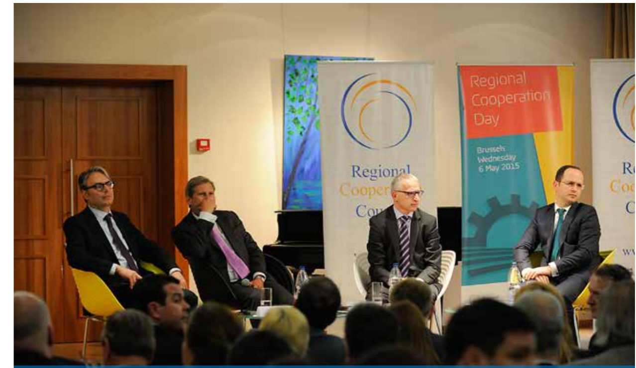
In an effort of strengthening cooperation between RCC and the Brussels based institutions, as well as promotion of the region in the EU, the RCC Secretariat organized a Regional Cooperation Day, dedicated to South East Europe, in Brussels on 6 May 2015.