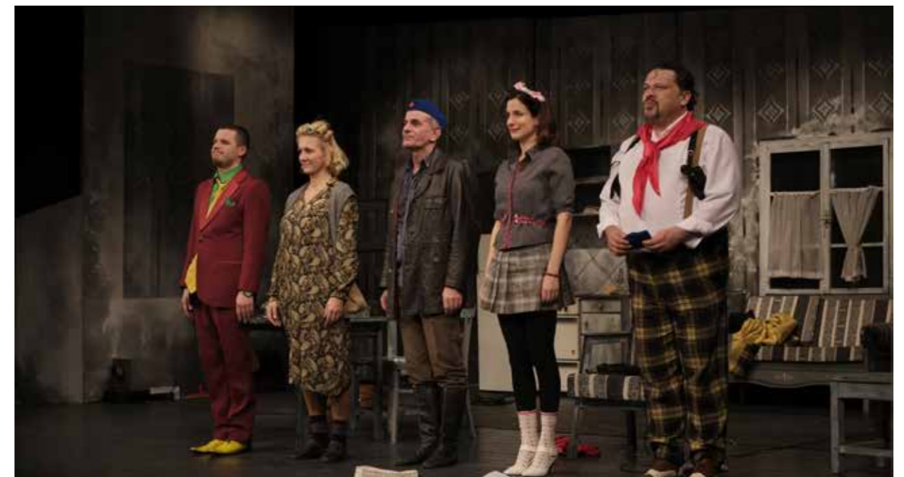
Regional Cooperation Council (RCC) supported a guest performance of "Balkan spy in Sarajevo" in Zvezdara Theatre in Belgrade on Friday, 11 December 2015.

Within the SWP 2014-2016 as well as the SEE 2020 Strategy, Cultural and Creative Sectors are placed in a strategic context for development and growth,