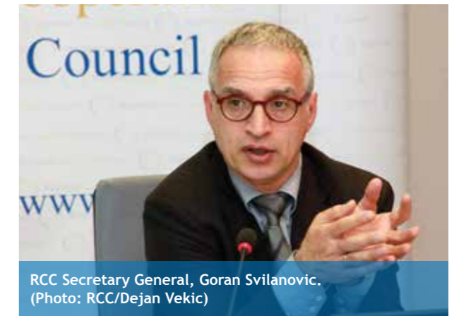
RCC Secretary General, Goran Svilanovic.

On balance, the onset of the period under review has been propitious for regional cooperation, only to be shaken later by developments that have tested the values of the region - good neighbourliness, mutual trust and appeasement. Threats such as