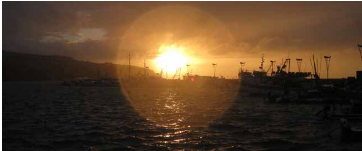
Winner of Round 5, for the topic Trade - key of success is in cross-border cooperation?, of the RCC's Voice of the Region contest: 'Harbour of Possibilities, Koper, Slovenia.

An all-inclusive, regionally-owned and driven cooperation framework, the Regional Cooperation Council (RCC) continued, in the reporting period, to pursue its mandated mission in an effort to meet the expectations of its stakeholders.