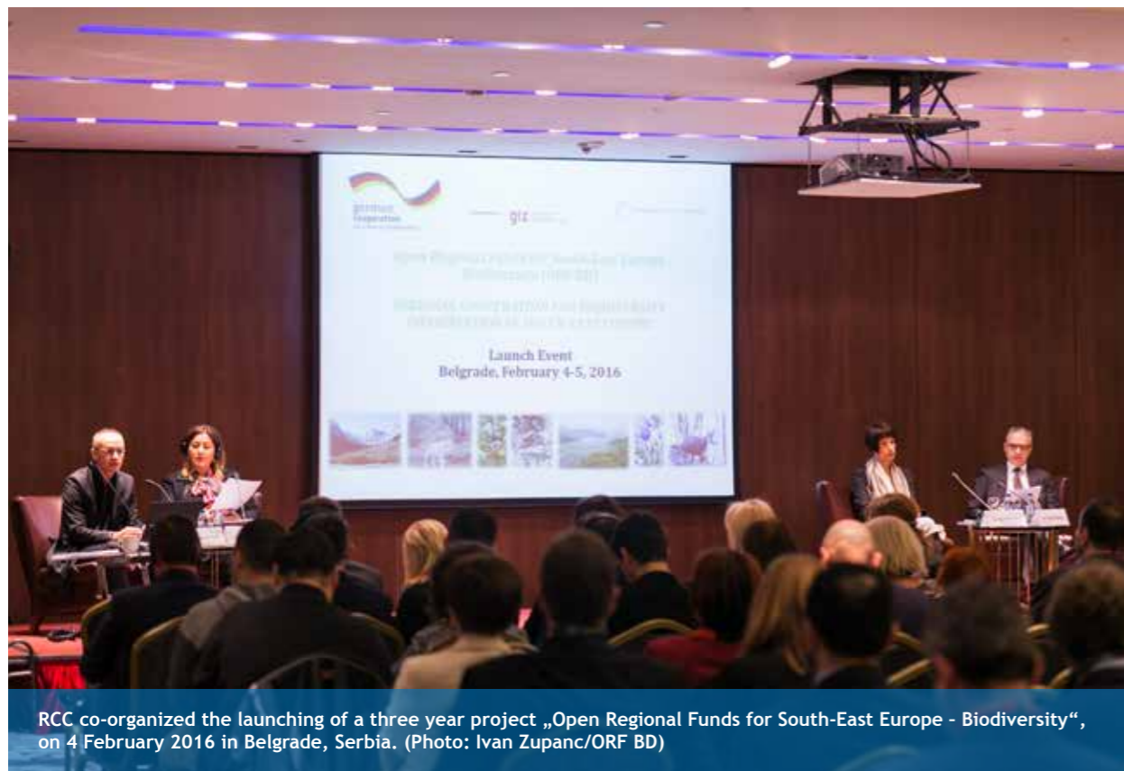
RCC co-organized the launching of a three year project „Open Regional Funds for South-East Europe - Biodiversity“, on 4 February 2016 in Belgrade, Serbia.

Though significant challenges remain in the region that is still poorly connected, lacks adequate infrastructure and shares strained fiscal space, has yet to attain full legislative alignment and to demonstrate credible track record in the areas of transport and energy, the developments within the reporting period demonstrate that significant progress is attainable once a number of enabling factors are in place. Those factors entail: highest political commitment, frameworks for intensified regional cooperation dynamics, strong monitoring framework by empowered regional structures, concrete and available financing mechanisms and