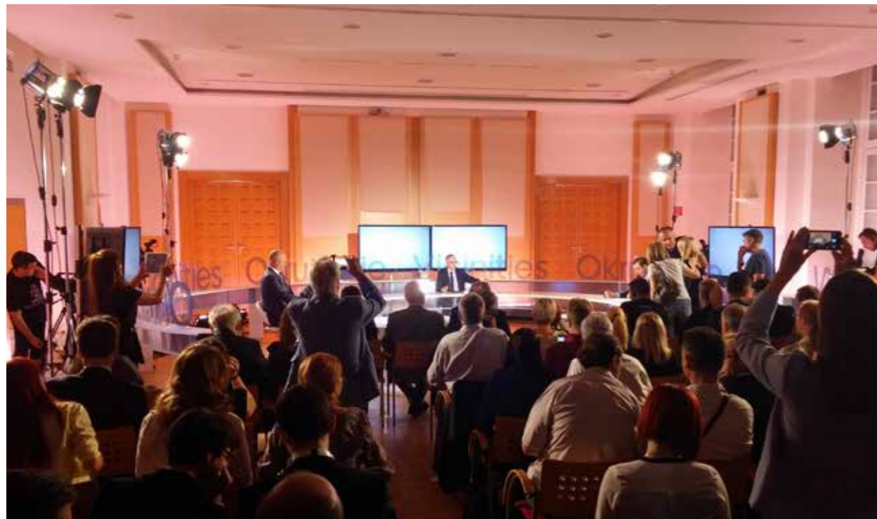
On the sidelines of Vienna Summit on Western Balkans, the RCC Secretary General, Goran Svilanovic, took part in the TV Talk Show "Okruzenje", with Albanian and Serbian Prime Minister, Edi Rama and Aleksandar Vucic, respectively, in Vienna, on 26 August 2015.

The principles and priorities of the enlargement policy reaffirmed in the Enlargement Strategy Paper, as well as the support expressed by the EC for SEECP, RCC and the SEE 2020 Strategy are crucial for the future work of the RCC and, above all, its role in facilitating and supporting the EU enlargement process.