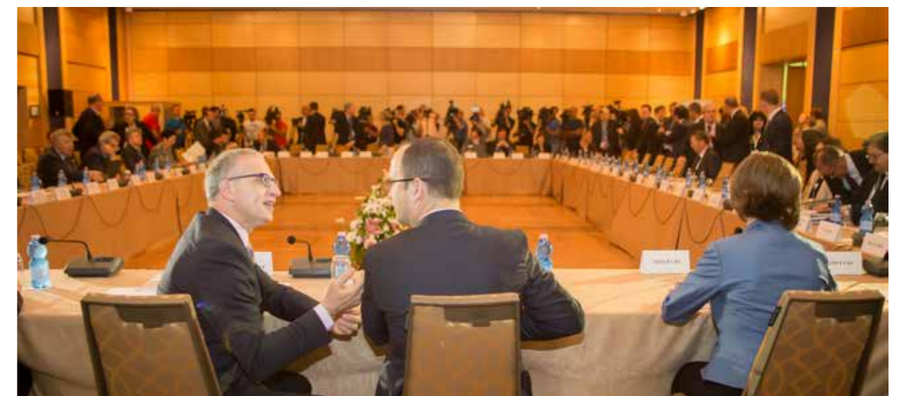
RCC Secretary General, Goran Svilanovic (left), and Albanian Foreign Minister, Ditmir Bushati, at the 8th RCC Annual Meeting, in Tirana on 22 May 2015.

The RCC Board convened on three occasions in the course of the reporting period. The RCC Board provided operational guidance and supervision, which proved essential for the RCC in the