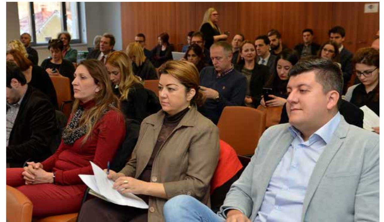
RCC Secretariat organized the second Regional Cooperation Day in 2015: “End of a tough year, what will 2016 be like?”, in Sarajevo, on 18 December 2015

Roma Integration 2020, an initiative co-funded by the European Union and the Open Society Foundations, started its implementation in the framework of the Regional Cooperation Council Secretariat, following the decision of the RCC Board in October 2015. The three-year project sponsored by the EC, Open Society Foundations and the RCC was structurally embedded within the Regional Cooperation Council (RCC) and is run by the Roma Integration 2020 Action Team, based in Belgrade. RCC Secretariat, together with the representatives of the EC and OSF, carried out the recruitment process for the Roma Integration Action Team. On 1 st of April 2016 Roma Action Team started with the implementation of the project activities in order to ensure technical and expert assistance to enlargement governments in Roma inclusion policy design, budgeting, monitoring and mainstreaming as well as to reinforce national and regional dialogue, cooperation, coordination on Roma inclusion and enhanced involvement of Roma community in the definition and implementation of integration policies. Roma Integration 2020 is implemented in the Western Balkans and Turkey.