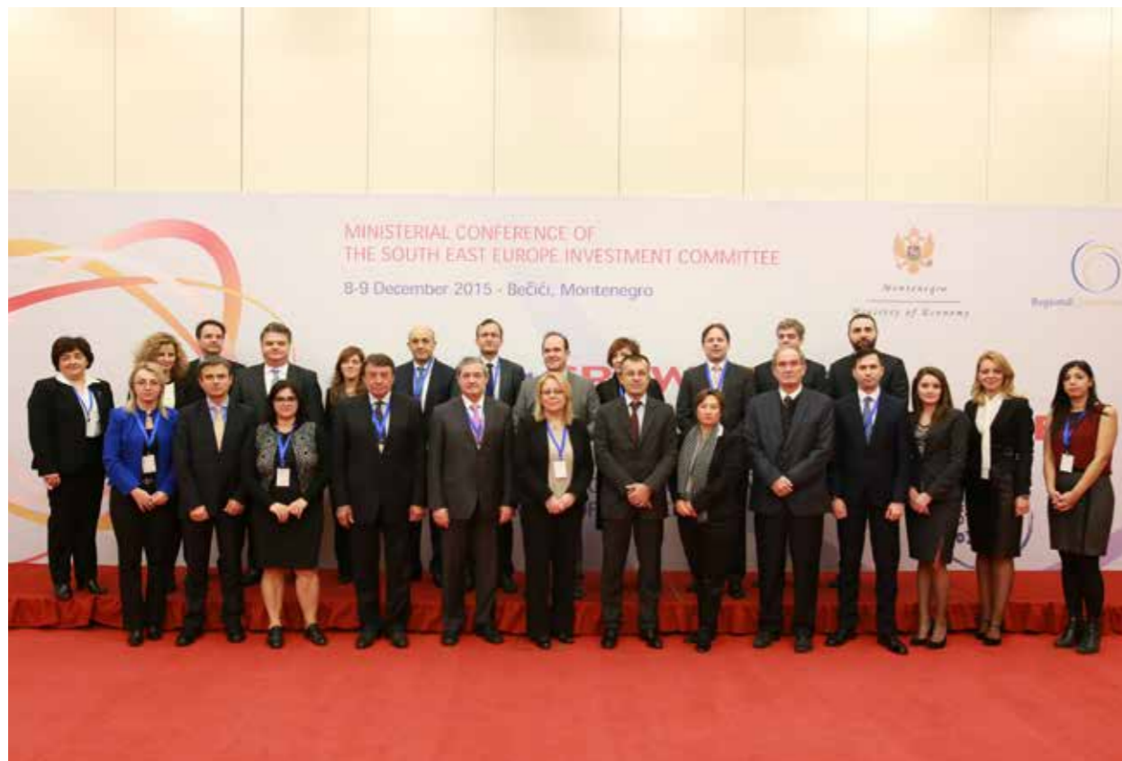
The SEEIC Ministerial Conference was held on 9 December 2015 in Budva, Montenegro.

In this dimension of Integrated Growth, an extensive regional programme was finalised on the establishment of the regional investment reform dialogue and agenda, which is to tackle regional investment policy coordination in the areas of investor entry, mutual protection and investment