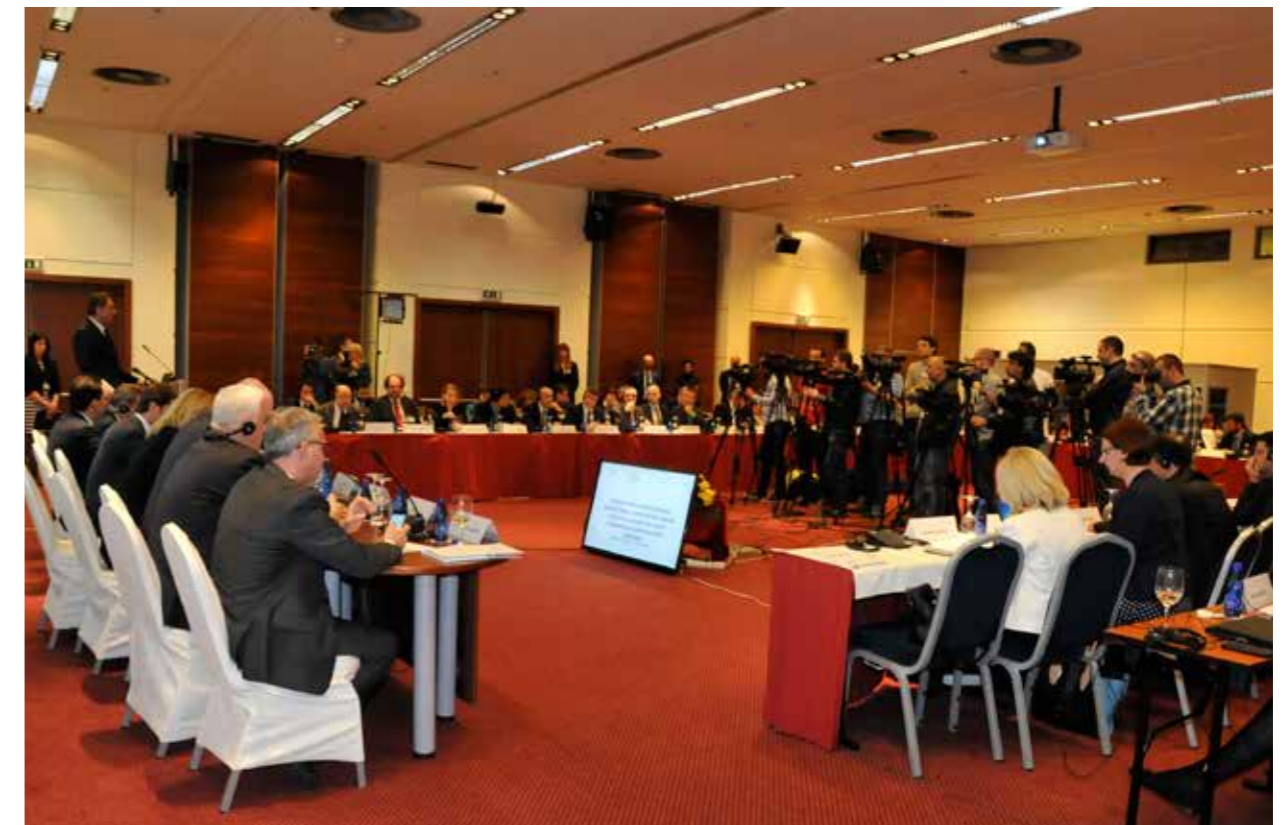
Justice and Home Affairs Ministerial Conference Brdo Process and South-East European Cooperation Process, held on 16-17 April 2015.

The concrete results of the preparatory processes and consultations are to be achieved in the course of 2016. The functioning of the two regional networks in the area of justice will provide a basis for more efficient and competent judiciaries.