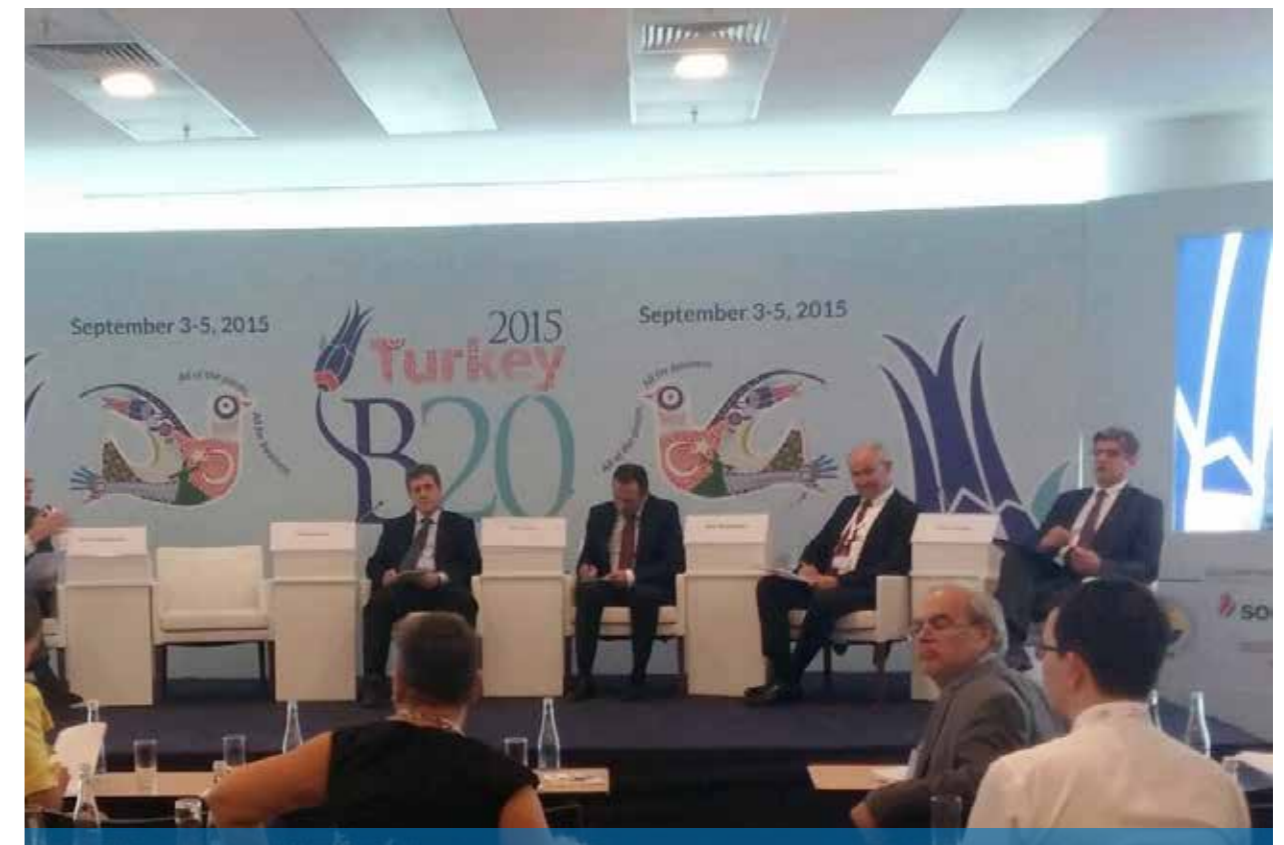
Regional Cooperation Council, together with Turkish TOBB, co-organized the 'Integrating South Eastern Europe to Global Markets' session at B20 Conference in Ankara, Turkey, on 3-5 September 2015.