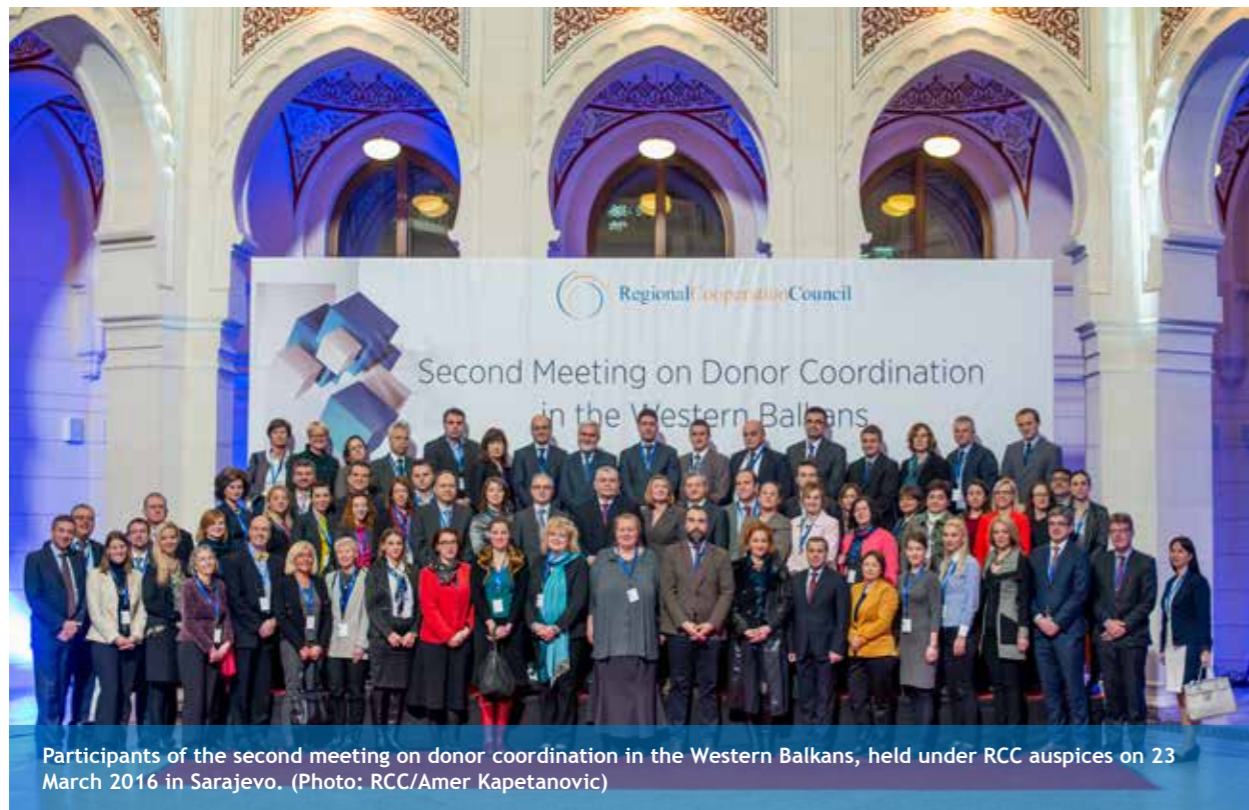
Participants of the second meeting on donor coordination in the Western Balkans, held under RCC auspices on 23 March 2016 in Sarajevo.

RCC has used the current SWP 2014-2016 to fundamentally alter the regional cooperation process in SEE in the past three years. The SEE 2020 Strategy has been a crucial part of this transition as it enabled the organisation to rethink its role and put in place credible multilateral processes to set joint regional vision and targets (through SEE 2020), prioritise actions (through structured programming), review progress being made in more tangible terms (through monitoring), and enhance coordination with governments, regional and international organisations and donors. The SWP 2014-16 also presented an opportunity for the RCC to increase its focus on fewer cooperation areas and build up capacities and competences to make it even more relevant for its participants in the next period, covered by the new RCC's SWP 2017-19.