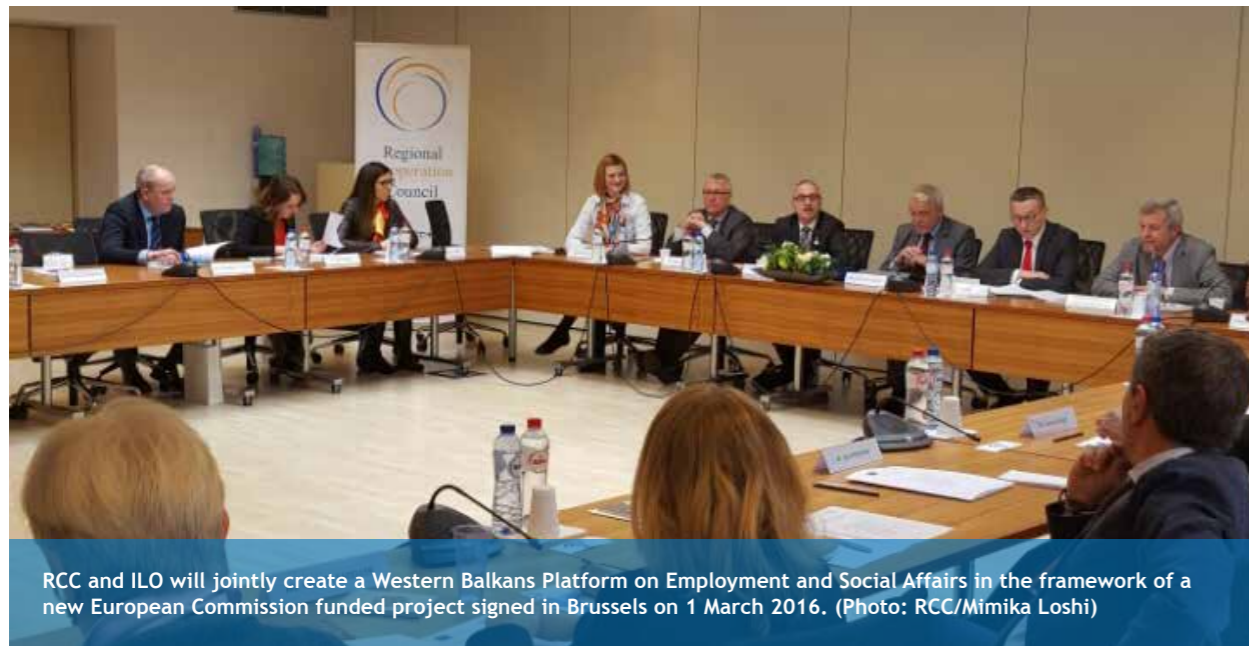
RCC and ILO will jointly create a Western Balkans Platform on Employment and Social Affairs in the framework of a new European Commission funded project signed in Brussels on 1 March 2016.

Furthermore, the RCC has, in cooperation with TEPAV, successfully completed a comprehensive analysis providing recommendations on increasing the business synergies between the SEE economies and Turkey 11 . The study was finalised and published in December 2015, with initial results presented during the B20 Conference in Ankara on 4 September 2015 at the panel co-hosted by the RCC and Union of Chambers and Commodity Exchanges of Turkey (TOBB) and dedicated to the SEE-Turkish cooperation.