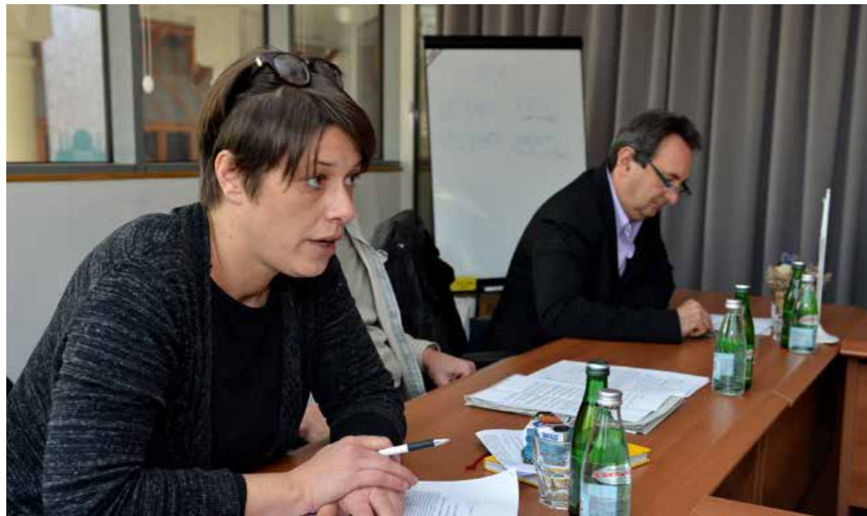
On the side-lines of the Regional Cooperation Day, the RCC organized a workshop for media in South East Europe - Reporting on the Region in the Region, in Sarajevo on 18 December 2015.

One of the main conclusions is that the support for women entrepreneurship has been moved from project to an ongoing process - regionally and individually in each of the participating economies.