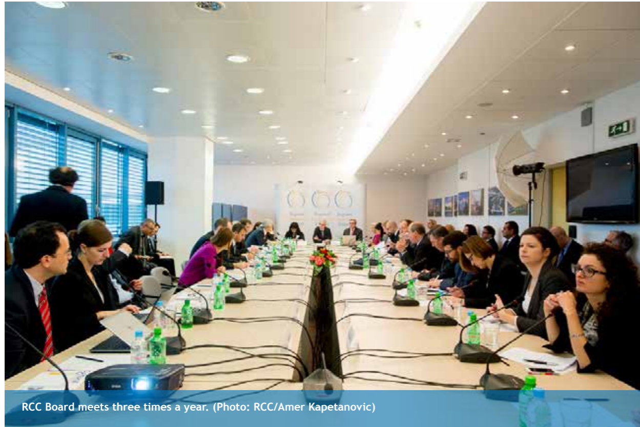
RCC Board meets three times a year.

2017-2019 aims at establishing a more structured dialogue and cooperation also with other partners and regional stakeholders, private sector representatives, civil society and region's media. All the above will make RCC a more efficient and more inclusive cooperation framework, and will also boost the effects and benefits of its interventions over the broader SEE.